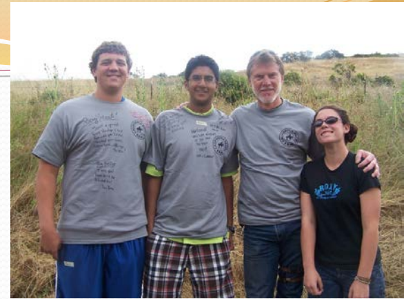
2010 Top Campers